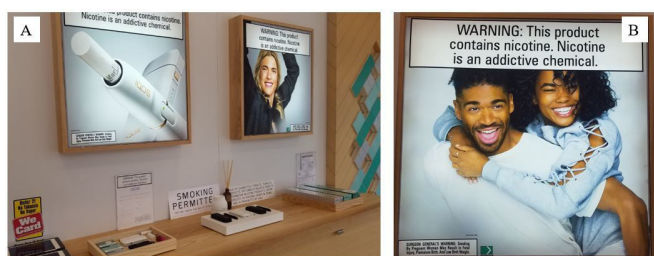
Figure 3 Display and advertisements from inside the IQOS mobile unit (A). Advertisement for IQOS featured inside mobile unit and retail stores (B).

A getiqos.com website was launched by PM USA in August 2019. 2-4 In order to gain access to most parts of this website, a shopper must register for an account, self-certify that they are a current cigarette smoker 21 years old or older (by providing their name, address and driver's license number), and answer some questions about tobacco use. Then, they must correctly answer questions about themselves (eg, prior addresses and past lenders) to confirm their identity. Once granted access to the password-protected website, the shopper is able to read information about IQOS and watch instructional videos about IQOS, access an IQOS store and retail partner map locator, participate in the refer-a-friend programme, schedule an appointment for a personal IQOS trial or service and support for device issues, learn about and access IQOS care, register an IQOS device and order IQOS products. Through the 'Shop IQOS' portal, shoppers (at present, only those with a Georgia street address) can order the IQOS device kit, the individual components of the kit