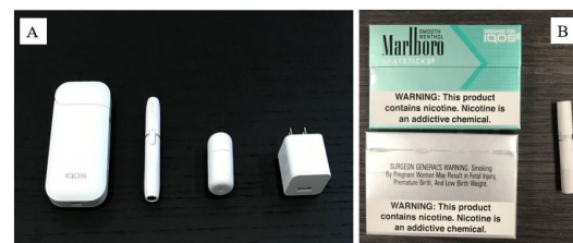
Figure 1 IQOS charger, device and cleaning brush (A) and HeatSticks (B).

At the stores visited in Atlanta, the device sells for $100, and 10 packs of HeatSticks (each individual pack contains 20 HeatSticks, which makes 10 packs equivalent to a carton of cigarettes) sell for $55. This pricing is almost identical to costs reported in South Korea. 2 However, with a bundle discount for purchasing them both and for having a profile with PM USA, the total cost is reduced to $87.12 ($80 for the device and HeatSticks and $7.12 in tax). Currently, IQOS offers a refer-a-friend programme for $20 off purchases for both the customer and the friend. Employees at the mall locations also mentioned the possibility to earn rewards that can