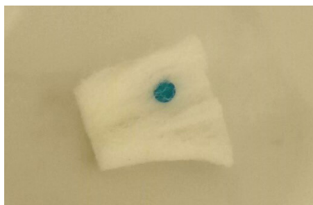
Figure 1 Menthol capsule located inside a filter.

flavour if inserted into factory-made cigarettes or packs of RYO tobacco. 38 39